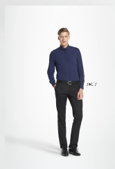
BECKER MEN 01648